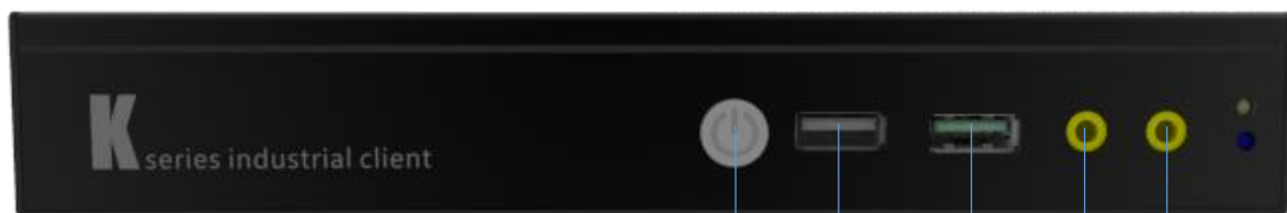
Power button USB2.0 USB3.0 Audio Jack