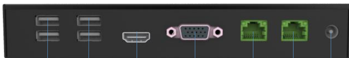
2*USB2.0 2*USB2.0 HDMI VGA (Colay COM) RJ45 RJ45 DC-IN